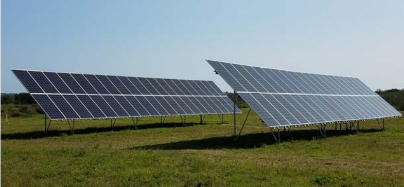
Detroit Lakes Public Utility's 29.3 kW Select Solar Community Solar Garden Detroit Lakes, MN