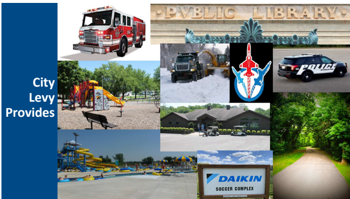
City Levy Provides

Your tax dollars pay for many different services. City services include items such as 24/7 police and fire protection, plowing of City streets, code enforcement, a municipal airport, the Owatonna Public Library and Owatonna's many parks and recreational amenities. To name a few of those amenities, we have the new Daikin soccer complex, River Springs Water Park, Brooktree Golf Course, the Tennis & Fitness Center, the new Miracle Field at Manthey Park, several miles of trails and numerous park facilities.