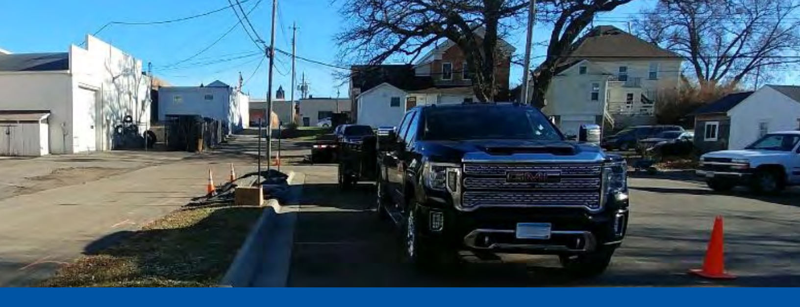
Information and graphics for this article obtained from the Minnesota Pollution Control Agency.

To support electric vehicle (EV) use and make ownership practical for more residents, Minnesota needs a statewide network of EV charging stations. The Minnesota Pollution Control Agency (MPCA) has awarded grant funds to ZEF Energy, Inc., of Minneapolis to install 22 EV charging stations around Minnesota.